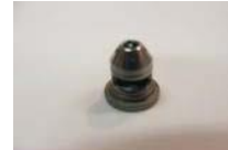
Code: 21665 3.3mm Vacuum Nose $77.00