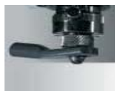
Code: 21672 Vacuum nose kit 3.3mm diam $120.00