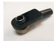
Code: 21673 Vacuum Nose Kit 8mm diam $115.00