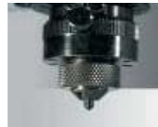
Code: 22884 Diamond holder nose $100.00