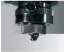
Code: 20130 Steel nose 0.7mm diam $40.00

Steel noses Teflon noses Swivel noses Prismatic noses Vacuum noses Diamond noses the most commonly used noses (resistant and highly polished for minimum plate scratching) for engraving on easily scratched material such as metal for engraving on curved surfaces (steel or teflon) for engraving on jewellery items such as ID bracelets or bangles same as steel nose + can be linked to swarf for engraving on jewellery items such as ID bracelets or bangles same as steel nose + can be linked to swarf extractor provides better rigidity and accuracy than a non rotative diamond cutter - mainly used for photo engraving (Photostyle) and jewellery