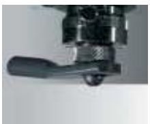
Code: 21674 Vacuum nose kit 1.5mm diam $120.00