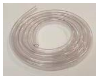
Code: 21670 Vacuum Nose Pipe 2.5m $17.00