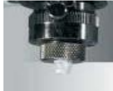
Code: 20133 Teflon nose 3mm diam $30.00