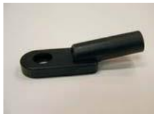
Code: 12720 Plastic Vacuum Nose Nozzle $20.00