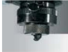
Code: 20131 Steel nose 1.5mm diam $33.00