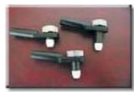
Code: 28061,28062,28063 Teflon long-reach vacuum $210.00

* These noses can be made into vacuum noses with adaptor code: 12720