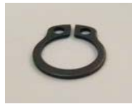
Code: 12721 Circlip for Chip Nose $5.00