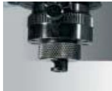
Code: 21086 Steel nose 4.6mm diam $58.00