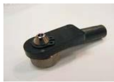
Code: 21672 Vacuum Nose Kit 3.3mm diam $120.00