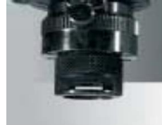
Code: 20960 Steel nose for multiline 16mm diam $150.00