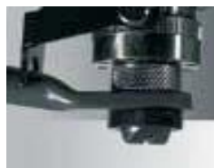
Code: 22885 Swivelling prismatic nos $267.00