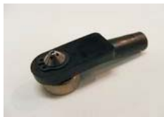
Code: 21674 Vacuum Nose Kit 1.5mm diam $120.00