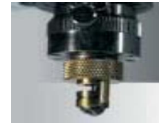
Code: 22464 Steel vacuum swivel nose 2.5mm diam $121.00