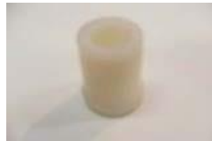
Code: 12719 Suction Nose Adaptor $40.00