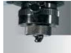
Code: 20132 Steel nose 2.5mm diam $30.00