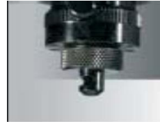
Code: 21755 Steel nose for diamond cutter 2.4mm diam $130.00