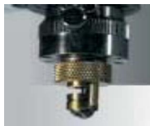
Code: 13058 Steel vacuum swivel no 5mm diam $100.00