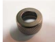
Code: 11881 Nose IR Retaining Ring $10.00