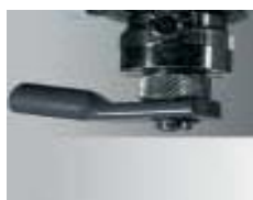
Code: 21673 Vacuum nose kit 8mm diam $115.00