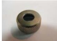
Code: 10116 Depth Nose Retaining Ring $12.00