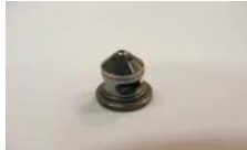
Code: 21666 1.5mm Vacuum Nose $50.00