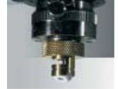
Code: 22481 Teflon vacuum swivel nose 3.5mm diam $121.00